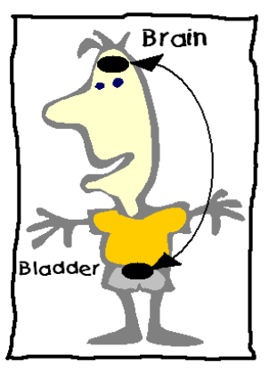
Figure 3. Brain-bladder connection.